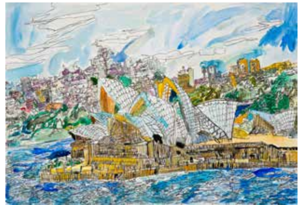
11013 Sydney Opera House Watercolor & Ink on Paper 25.5" x 39.5"