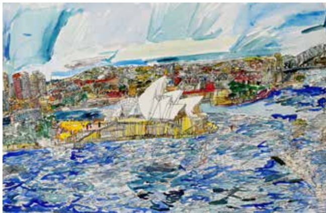
12003 Sydney Opera House Watercolor & Ink on Paper 20.5" x 29.5"