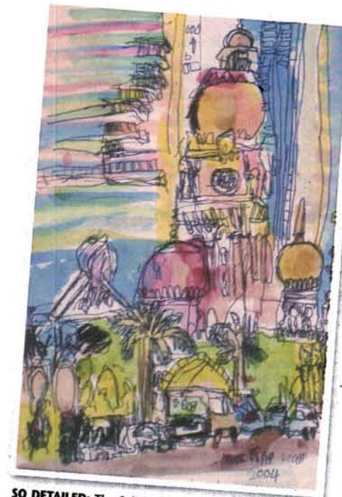
SO DETAILED: The Sultan Abdul Samad Building